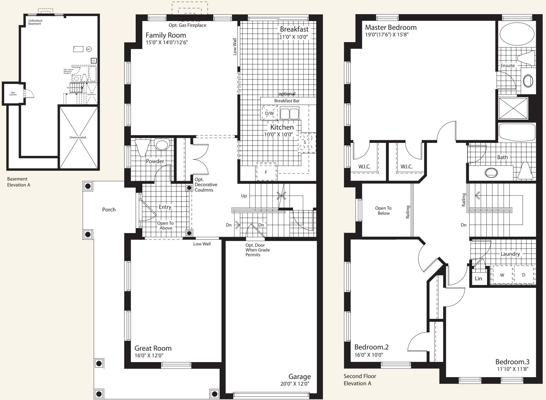
Ground Floor Elevation A