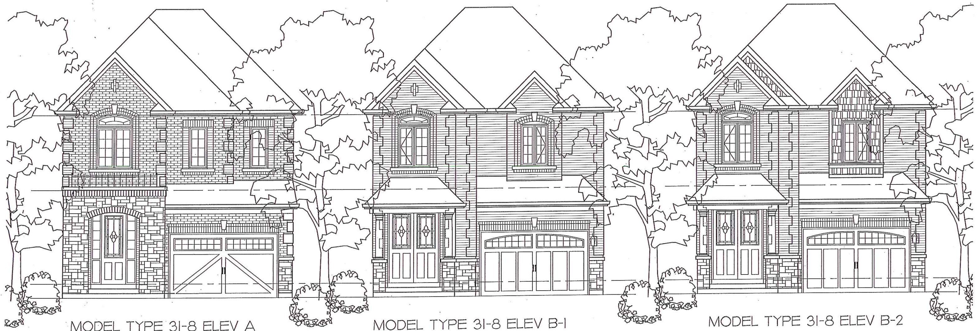
MODEL TYPE 31-8 ELEV A

GFA = 2080 SF (INCLUDES 108 SF OF OPEN SPACE)